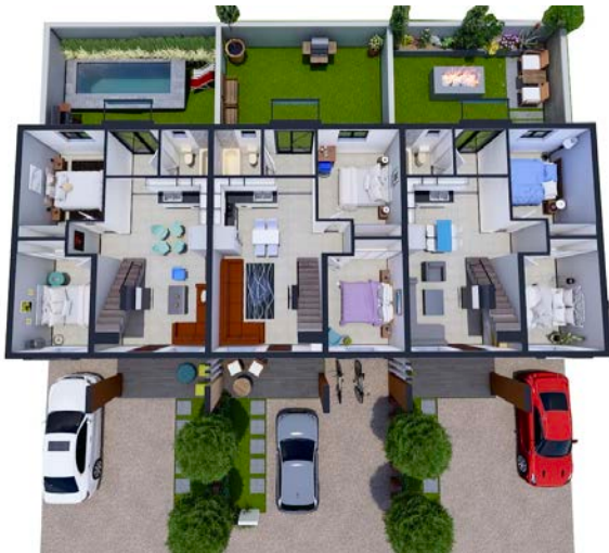
Block Layout- Ground Floor