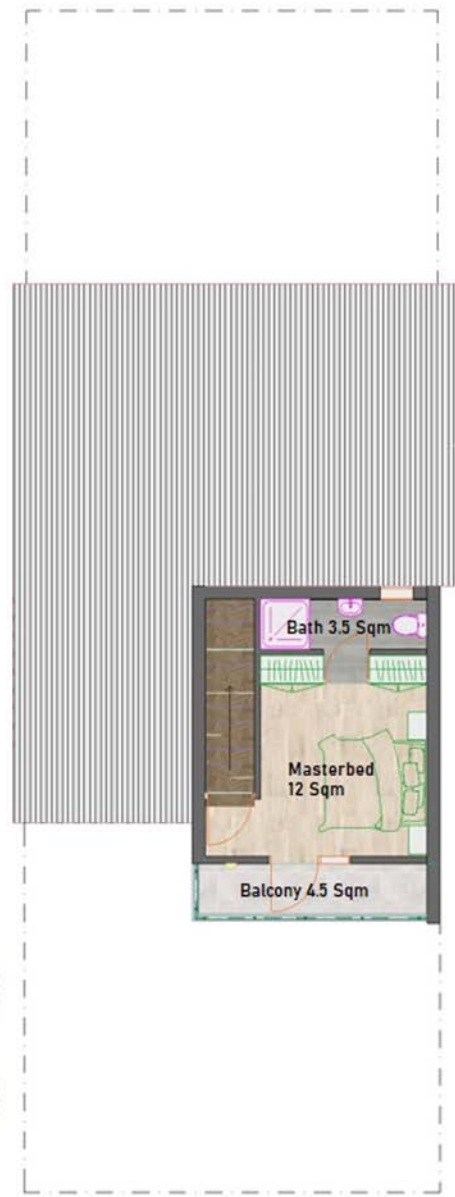
First Floor Unit Layout