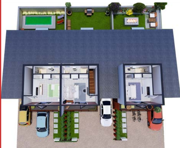
Block Layout- First Floor