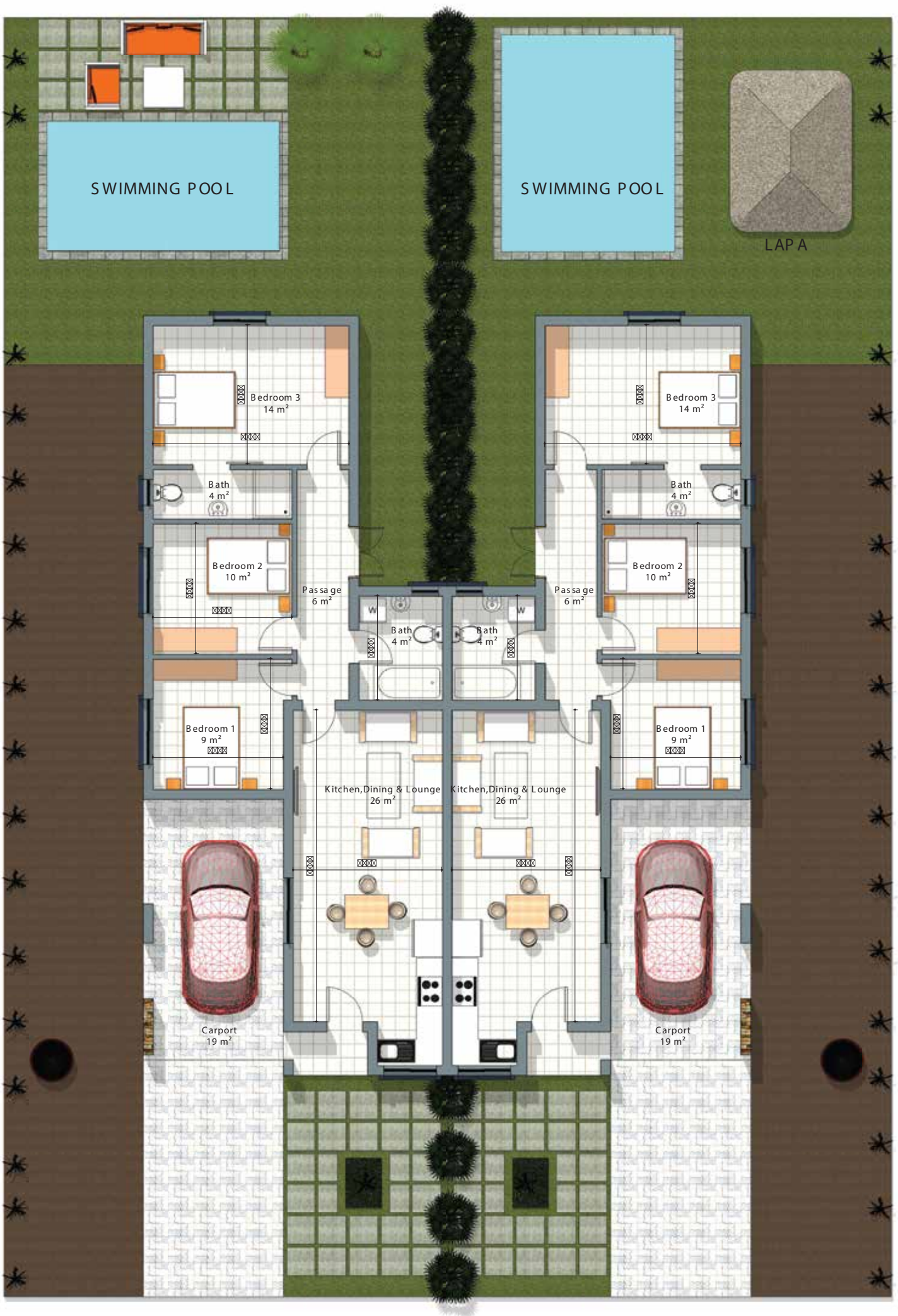
TYPE A UNIT SIZE: 108.5 SQM PLOT SIZE: 250 SQM